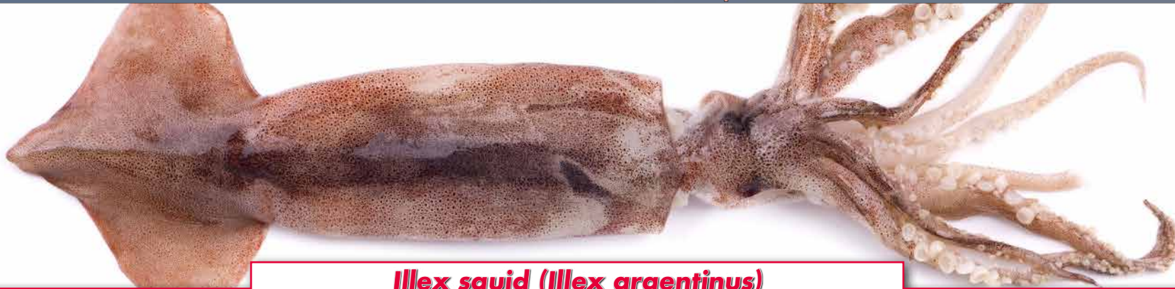
Illex squid (Illex argentinus)

Red shrimp | Hake from Argentina | Illex squid | Peruvian scallop | Other products