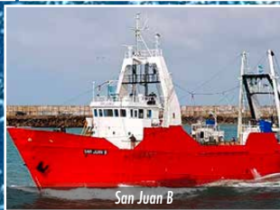
San Juan B